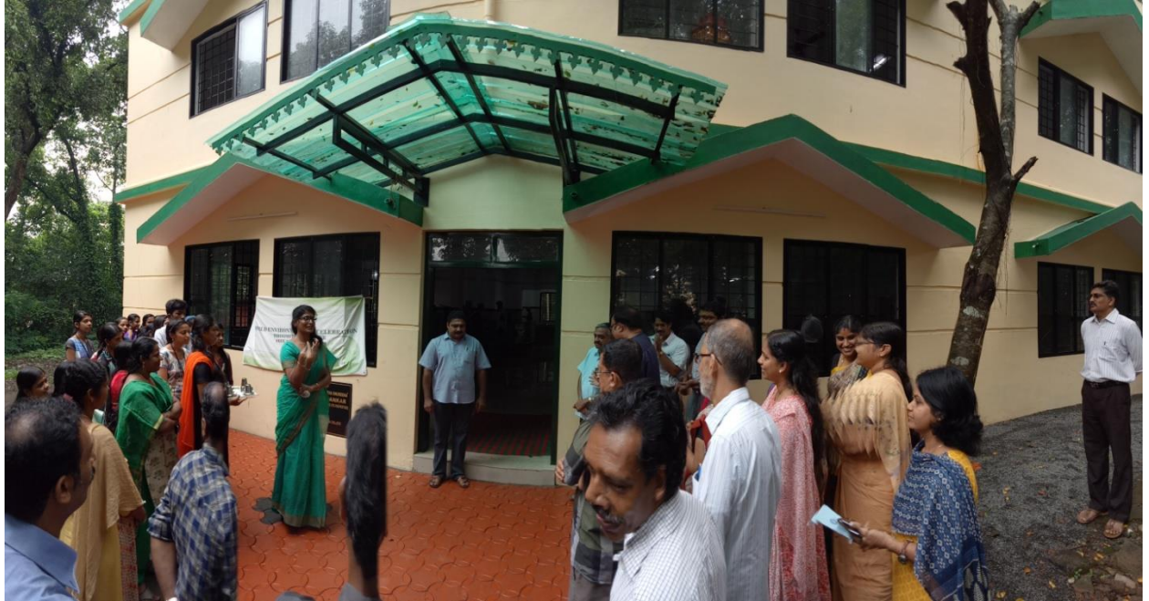
Giving extra glasses to the canteen staff