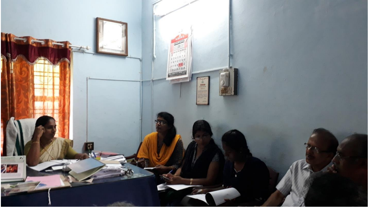
Visit to flood affected areas