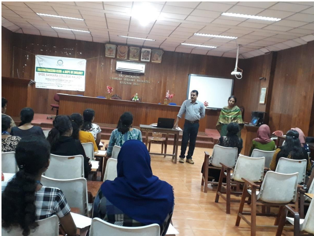
Presentation of the topic by contestants