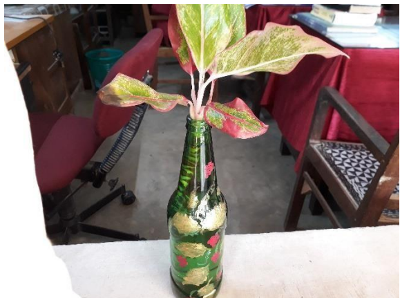
Bottle Art with Plants set in various departments