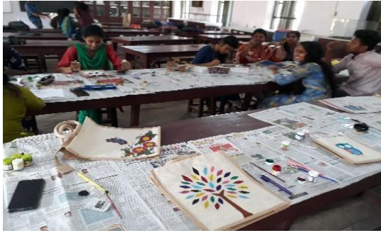
Jute bag designing Competition