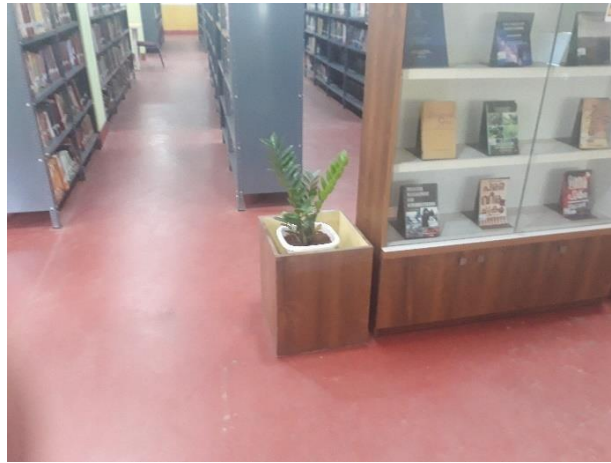
Indoor Plants set in the Library