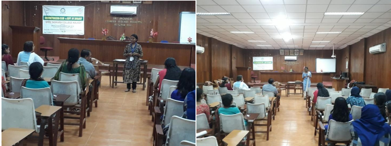
Judges' announcement of results