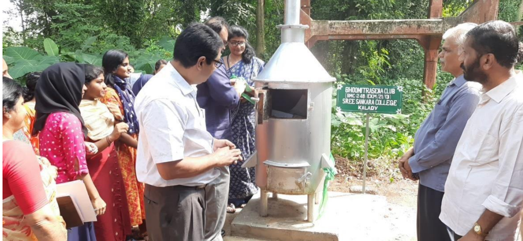
Indoor plants set in the Library