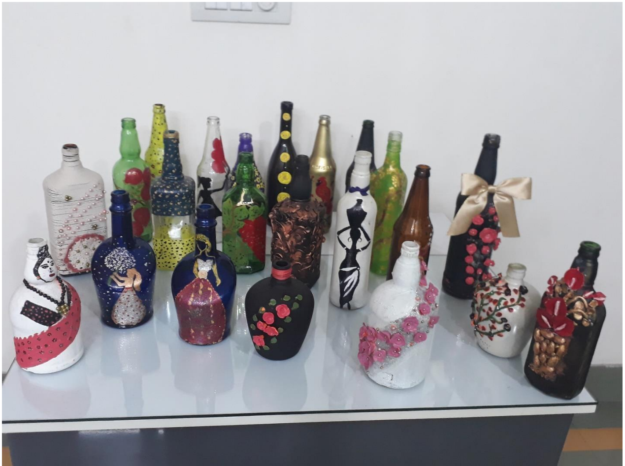
Lockdown Value time by the Coordinator